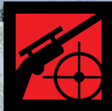
Rifle Shooting Merit Badge