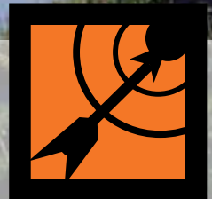
Archery Merit Badge

Candidates must also complete a hunter safety session and test.