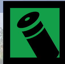
Shotgun Shooting Merit Badge